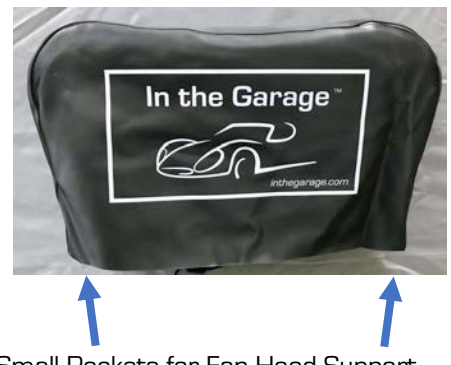
Small Pockets for Fan Hood Support

10. For the Outdoor version, you need to install the Fan Hood Support inside the hood above the fans. Place the ends of the support inside the small pockets of the hood. The support should take the form of the hood. You may need to push it up in the middle